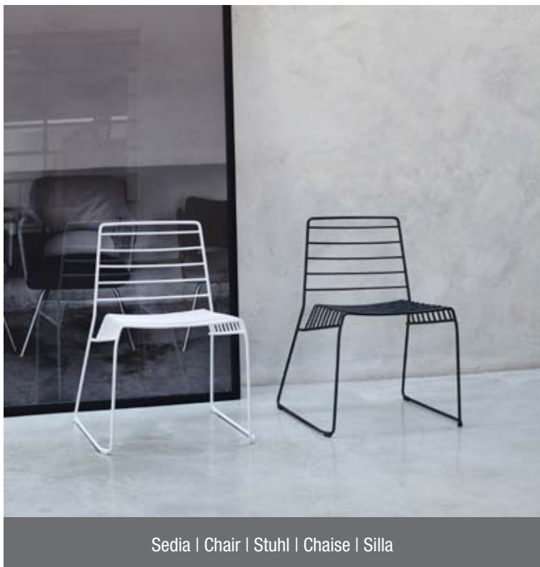
Sedia | Chair | Stuhl | Chaise | Silla